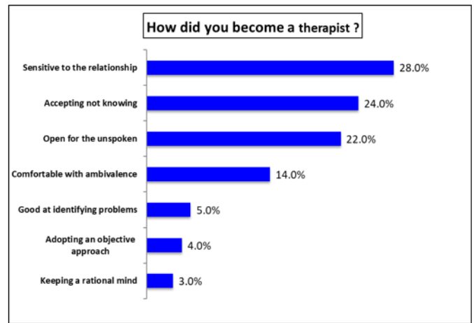
Figure 1: Sources of learning to become a therapist

This seemed, in turn, to resonate with the survey respondents favoured choice of methodology (see Figure 2).