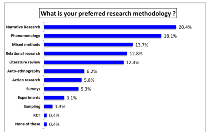
Figure 2: Favoured research Methodology

My training didn’t involve much research at all, it was about being experiential and working with embodied processes in therapy. It doesn’t fit in with the evidence-based framework. [...] Measuring won’t help us to understand what it’s about to be a person, a human. (Ab3)